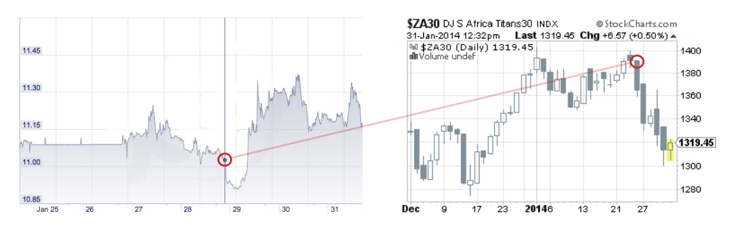
NOTE: This material is for discussion purposes only. This is not an offer to buy or sell or subscribe or invest in securities. The information contained herein has been prepared for informational purposes using sources considered reliable and accurate, however, it is subject to change and we cannot guarantee the accurateness of the information.

The day after the failure of Turkey's intervention, South Africa similarly attempted to support their currency with a surprise increase in rates. The results were exactly the same, with currency weakness causing the market to fall even in nominal terms.